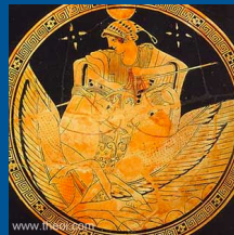
Selene driving Pegasus-chariot, Athenian red-figure kylix (5th B.C., Antikensammlung, Berlin)

© All original material in this site is under copyright protection and is the intellectual property of the author.