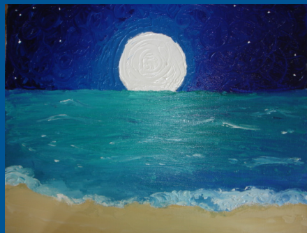
"Selene rising from Oceanus"

☆ The day to honor Selene is February 7th.