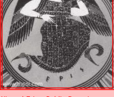
Winged Eris

She is the mother of the spirits known as the Kakodaimones. These Children of Chaos inhabited Pandora's box and were unwittingly unleashed into the world. Eris is a fiercely protective Mother. She sought revenge on the Gods of Olympus on behalf of Her Children, when She and Her brood were the only Gods forbidden to attend the wedding of Thetis and Peleus. What Mother today would not feel outrage to find her children were the only ones not invited to a party? In these circumstances, Eris becomes the champion of social justice, standing up for those who cannot defend themselves.