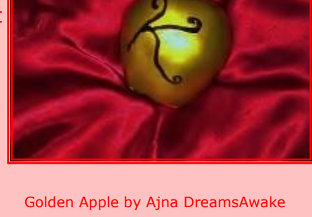
Golden Apple by Ajna DreamsAwake

The Apple is inscribed with the word Kallisti which means "To the fairest" or "To the prettiest". But the Apple can just as easily mean to the richest, the most powerful, the chosen. People's true colors come out when they attempt to take the Apple for themselves. People will see what they want to see within the Apple, and will do anything to keep it for themselves, including having power over others and trampling peoples rights.