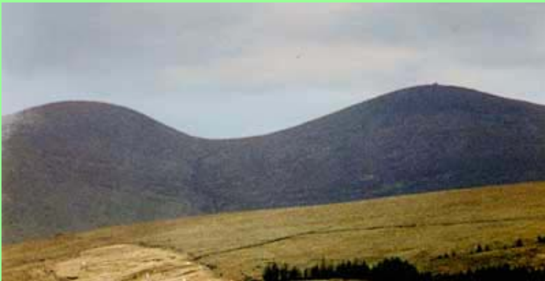
Figure 1 used with permission of

Not far from where my mother was born in County Kerry, Ireland, there is a beautiful natural expression of the Great Mother: the Paps of Anu (or breasts of Ana). They are two mountains...no, they are two breasts, manifesting the presence of the Goddess. Ancient people built cairns (stone houses) on top of each breast, resembling nipples, for they yearned for her nurturance.